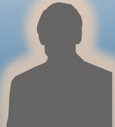
Cadet of Today Anywhere, USA