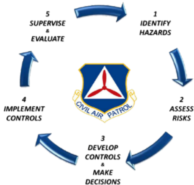
Figure 1.2 – Risk Management

1.4.2. Pillar 2 - Safety RM. RM is the key to mishap prevention. RM is a five-step deliberate decision-making process as depicted in Figure 1.2. The loop in the figure symbolizes that the RM process is on-going. The process begins in the planning stages with hazard identification and assessment of risks. Risk controls are developed and implemented. Supervision and evaluation ensure controls are effective and adjusted when needed. The process continues after the activity with assessment of the effectiveness of the controls, allowing for continuous improvement efforts.