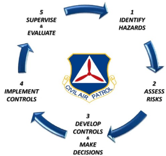
Figure 3.1 Risk Management Steps

3.2. RM Principles. There are four principles which govern all applications of RM. For RM to be effective in CAP, these principles must be present 24 hours a day, 7 days a week, 365 days a year, and used by all staff and members in all tasks and activities.