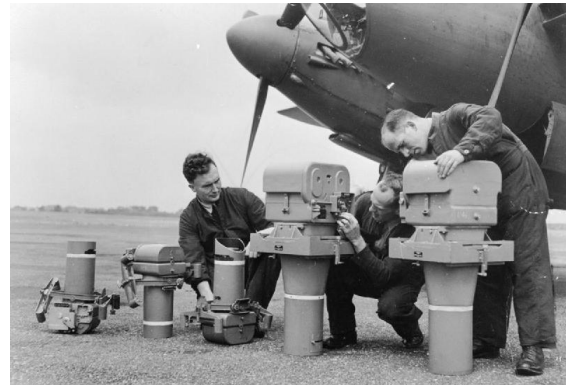
PRU technicians and a display of aerial cameras in front of a PR Mosquito. From left to right the cameras are two F.24 14-inch lens vertical cameras, one F.24 14-inch lens oblique camera, two F.52 vertical cameras with 20-inch lenses