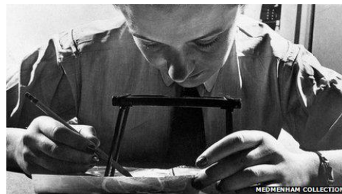
Babington-Smith using stereo viewer to examine overlapping photos.

The pilots get the glory but without photo interpretation, the images are useless. One of the best known practitioners was journalist Constance Babington-Smith. She worked at the British Central Interpretation Unit at RAF Medmenham. In April of 1943, she was tasked to look for unusual aircraft. In June, she discovered the Me 163 rocket interceptors and in November discerned a small aircraft mounted on a launching ramp, the V-1 cruise missile. She and some of her colleagues specialized in identifying launch sites and new aircraft, sometimes the only clue being scorch marks on the ground.