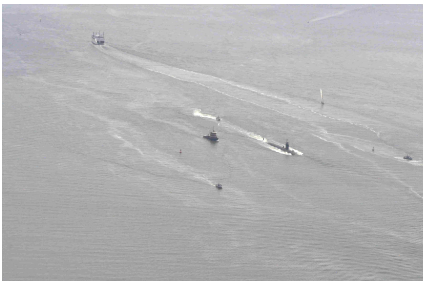
Traffic Congestion on the Thames A returning fast attack submarine escorted by a tug and three patrol boats passes the Orient Point Ferry and a sailboat.