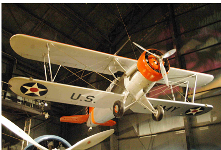
O-38F at the National Museum of the USAF

was minimal so in March and April of 1934, four aircraft, three Fairchild's and a Douglas O-38E from the 118 th Observation Squadron of the Connecticut National Guard commenced operations using Fairchild K-3 cameras with a 9.5 inch focal length and F/4.5 lenses. Each exposure was recorded on a 7.5 in by 9 in frame at a scale of 1 inch to 1,200 feet. Vertical exposures were taken at an airspeed of 100 mph from 11,400 feet with a 50% overlap. The 5,000 square miles of the state were covered in 153 flying hours using just under 10,500 frames of film.