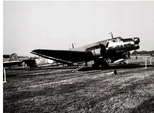
A Ju 86 on a Swedish Air Base Only two examples of this aircraft exist. One is in the Swedish Air Force Museum and the other is at the RAF Museum in Cosford

The Axis did not neglect photo-intelligence aircraft. Germany built the Junkers Ju 86-P1 and P2. These aircraft were pressurized, powered by liquid-cooled diesels, and could attain an altitude in excess of 40,000 feet. Some were built under license in Sweden.