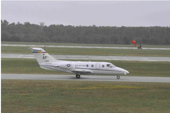
A Jayhawk of the USAF 479 th Flying Training Group based at Naval Air Station Pensacola.

The T-1A is a military adaption of the Beechcraft 400A which was originally the Mitsubishi MU-330. The military model has a beefed-up structure, a reinforced windscreen, and carries extra fuel.