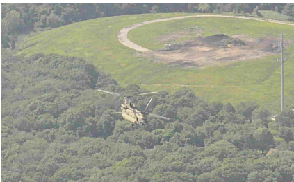
Traffic Congestion Over Waterford N482CA passes a National Guard CH-47 Chinook.