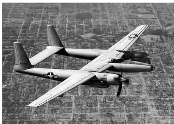
Hughes XF-11

Amazingly, a year later, Hughes flew the second prototype, now equipped with single propellers on each engine!