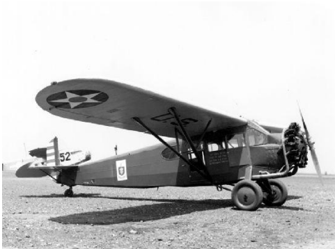
The Fairchild YF-1. (public domain)

The sole surviving F-10 was reconstructed as a B-25B and is one display at the USAFM as one of Jimmy Doolittle's Tokyo raiders.