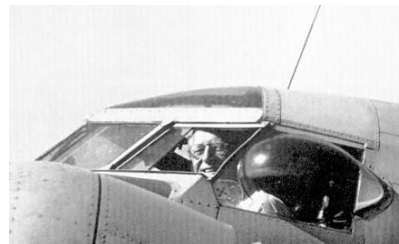
Cotton in the cockpit of his modified Electra, Junior

On return to England, Cotton became an agent for Dufaycolour film and flew around the continent marketing the product and promoting several other business schemes. Frederick Winterbotham, a member of the Air Section of the British Secret Intelligence Service (MI-6) realized that Cotton had a ready made cover for aerial espionage and recruited Cotton. Cotton's new company, Aeronautical Research and Sales, acquired, with the assistance of His Majesty's Government, several Lockheed Model 12A Electra, Jr. aircraft. The new "company" planes were equipped with vertical and oblique viewing cameras hidden under cunningly designed sliding panels and an unobtrusive switch in easy view of the pilot. The paint scheme was a duck-egg green specially ordered by Cotton which blended nicely with the sky background. One of the aircraft were fitted with long range tanks and a "bubble" window, invented by Cotton, to allow the pilot a view directly below the aircraft.