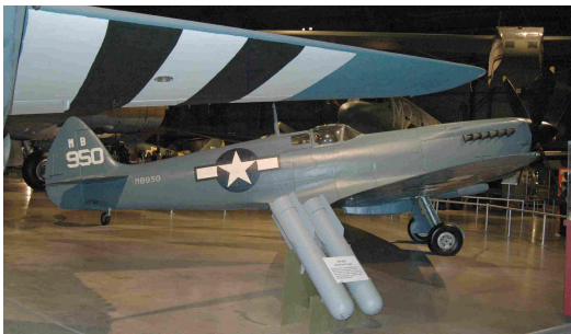
Above: A PR.Mk. XI Spitfire behind two AN-MQB parachute flares. The craft carries the colors of the 14 th Photographic Squadron based at Mount Farm Airfield, Oxfordshire.

Specialized British photo planes were so good that the USAF adopted two of them for their own air intelligence operations. Both a Spitfire and a Mosquito are both on display in the Museum of the USAF in their special camouflage.