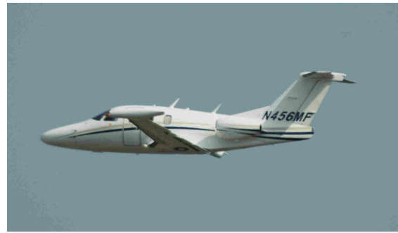
File Photo of Eclipse 500

Eclipse Aerospace or Albuquerque, N.M. have offered to provide their Eclipse 550 as a replacement aircraft, either through direct purchase or lease. The aircraft already had NextGen-compliant avionics and the company claim is that $11 billion will be saved over the next two decades in operations and sustainment costs since the Eclipse has a much lower fuel consumption rate and the newer aircraft will require less maintenance.