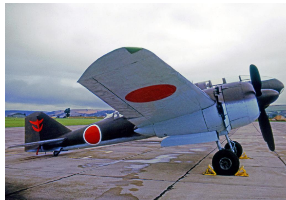
The last surviving Dinah is at RAF Cosford

The Japanese flew an aircraft known to the Allies as the Dinah. It was built by Mitsubishi and designated as the Ki-46. Some of these were modified as last-ditch interceptors against the B-29s.