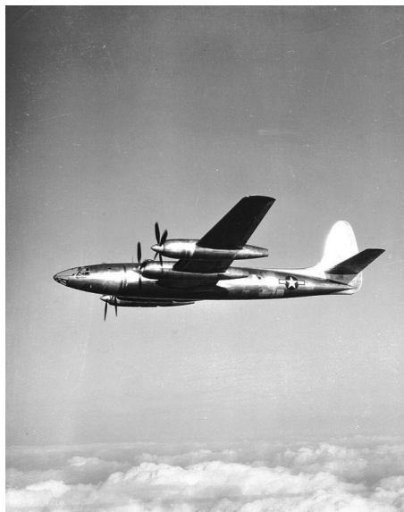
Republic XF-12

Kartveli was responsible for the formidable P-47 Thunderbolt and had a hand in the entire line of jet "Thunder-" aircraft produced by Republic. The XF-11 was radically different from the Hughes design. It used the same Pratt Wasp Majors but had four of them, faired into a high aspect ratio wing attached to a sleek fuselage. Engine cooling was handled by unique "sliding ring" set of cowl flaps which eliminated the drag of normal cowl flaps and the leading edge of the wing, between the engines, housed intercoolers for air intake which further reduced drag. Additional power was added by ejecting the engine gases directly aft through large elliptical exhaust ports. The result was that Republic produced the fastest four engine piston aircraft in history, cruising at over 400 mph.