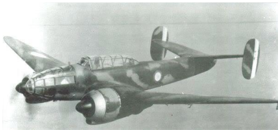
The Bloch 174

Early in 1940, St-Ex flew a Bloch 174 in a mission to determine the extent of the German penetration of French defenses. With a crew of two and, initially, a fighter escort, he departed Orly and reconnoitered several areas of interest at altitudes varying from 1000 feet to 150 feet. The fires burning in Arras were seen but storm intervened and they lost their fighter escort. A strong force of enemy tanks was noted southwest of the city preparing to attack. Flak damaged the aircraft and they started losing oil. After 1 hour and 40 minutes, they returned to base.