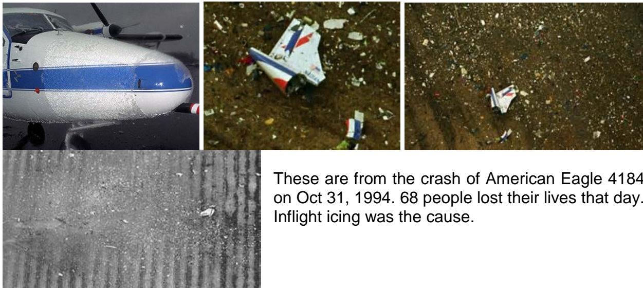
These are from the crash of American Eagle 4184 on Oct 31, 1994. 68 people lost their lives that day. Inflight icing was the cause.

The wing will ordinarily stall at a lower angle of attack, and thus a higher airspeed, when contaminated with ice. Even small amounts of ice will have an effect, and if the ice is rough, it can be a large effect. Thus an increase in approach speed is advisable if ice remains on the wings. How much of an increase depends on both the aircraft type and amount of ice. Stall characteristics of an aircraft with ice contaminated wings will be degraded, and serious roll control problems are not unusual. The ice accretion may be asymmetric between the two wings. Also, the outer part of a wing, which is ordinarily thinner and thus a better collector of ice, may stall first rather than last.