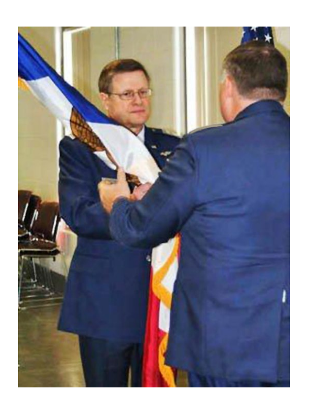
Published by: Education and Training Headquarters, Civil Air Patrol December 2022