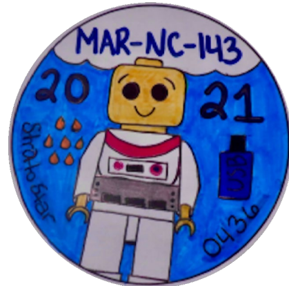
JOHNSTON COUNTY COMPOSITE SQUADRON MAR-NC-143