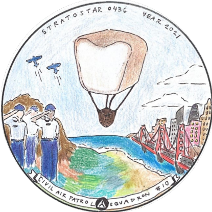
Jon E Kramer Composite Squadron PCR-CA-214