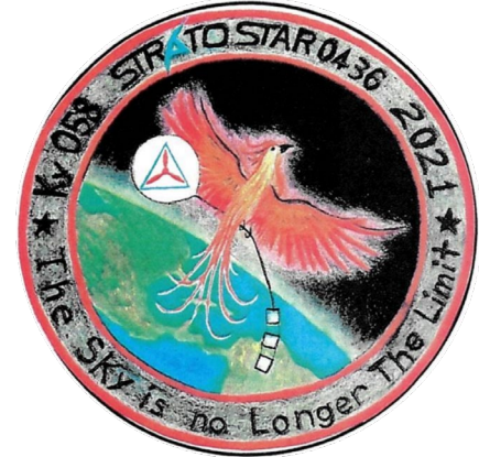
Frankfort Composite Squadron GLR-KY- 058