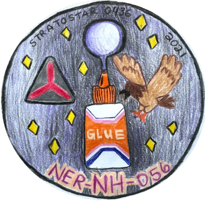
Hawk Composite Squadron NER-NH- 056