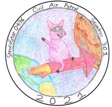
SkyHarbor Composite Squadron SWR- AZ-022