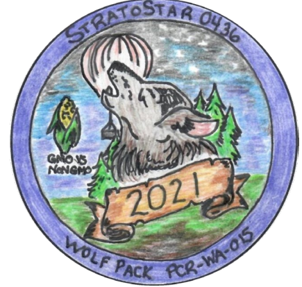
Bellingham Composite Squadron PCR- WA-015