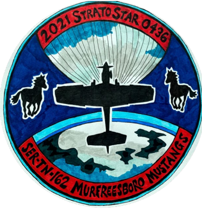
Murfreesboro Composite Squadron SER- TN-162