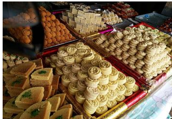
Diwali Indian Sweets

As a part of observing this festival, families place rows of oil lamps along the foundations, entry paths, and balconies of their dwellings. And that gives forth another name for the celebration: Deepavali. Deep , another name for the oil lamp, and avali , which means “rows or clusters of lamps.” South Indians most often use this name; north Indians tend to use Diwali. On this long new moon night, the rows of diyas give off a powerful glow, intended to entice Maha Lakshmi into the residence. Her blessed gifts offer an increased ability to fight against negative forces such as violence, greed, injustice, inequity, and suffering. During Diwali, Hindus dress in new clothes and bring platters of sweets to share with neighbors of all faiths and with employers and work colleagues, family, and friends. These visits and exchanges reinforce social connections. The night sky glitters and rumbles from firecrackers.