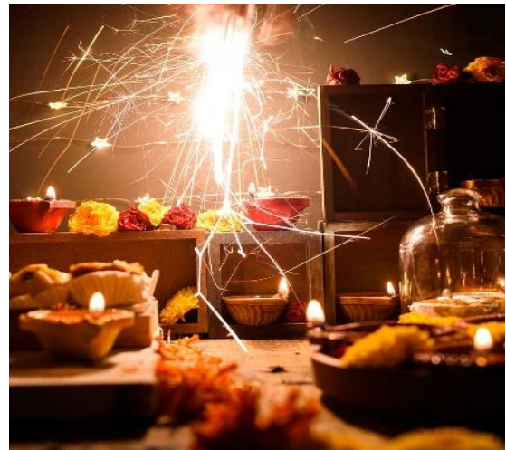
Diwali, Festival of Light

Deepavali, or Diwali, the Festival of Light, is the most important annual religious festival for Hindus. It is a pan-Indian multi-day celebration marked around the world. Diwali is associated with many sacred stories and family traditions. The main themes celebrate the triumph of good over evil, of light over darkness, and knowledge over ignorance. Hindu holy days are determined using two different lunisolar calendars within India, so these holidays seem to "float" from year to year for those following a Gregorian calendar. Furthermore, the period of observance differs regionally within India. For example, in the Indian state of Maharashtra, Diwali festivities begin a day earlier than in the state of Tamil Nadu. In the state of Gujarat, they begin two days earlier.