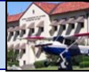
Table of Contents Contact Us